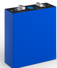
We use only high quality Grade A EVE LiFePO4 prismatic cells in our leisure batteries.

Many leisure battery suppliers simply won't know which cells are being used at the assembly phase, nor will they understand the grading, quality processes or what configuration is being used. This is why we've been involved since the inception of our product, selecting each component, from the prismatic cells, to the BMS and heating components - to create the ultimate leisure battery.